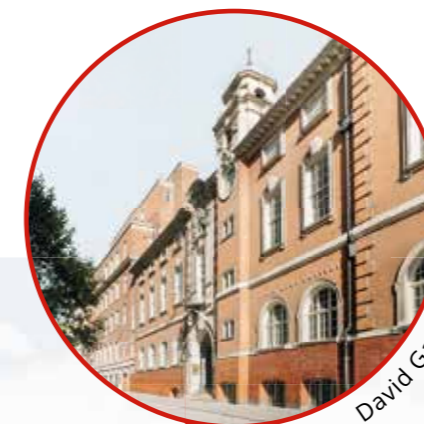
David Game College