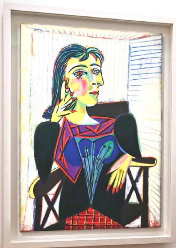
1937 Feminine O Pablo Picasso

We will learn about the origin of festivals such as the Seville Fair or Carnival, the importance of Dalí and Picasso, the musical revolution of Camarón and Paco de Lucia, the international projection of Almodovar and Antonio Banderas.