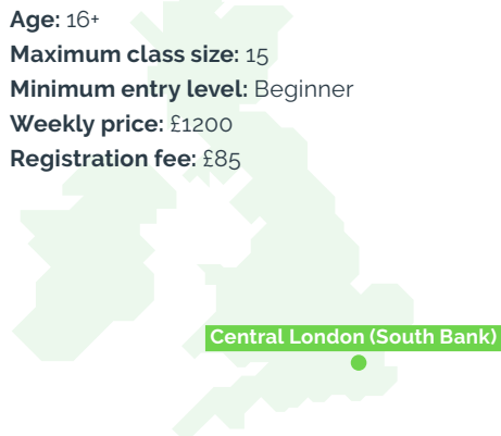
Central London (South Bank)

Course length: 2 – 4 weeks Start dates: 2, 9, 16, 23, 30 * July, 6 * and 13 * August. Wednesday arrive/Wednesday depart * 1-week bookings available Course ends: 20 August Lessons: 15 hours of English lessons per week Age: 16+ Maximum class size: 15 Minimum entry level: Beginner Weekly price: £1200 Registration fee: £85